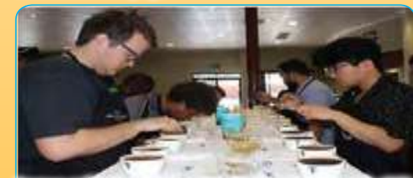
Overseas and local coffee judges assessing farmers' coffees at the 2016 coffee competition in Lae, Morobe Province.