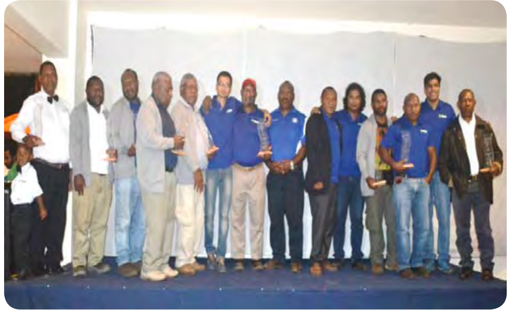
The top ten coffee suppliers with Outspan and CIC managers.