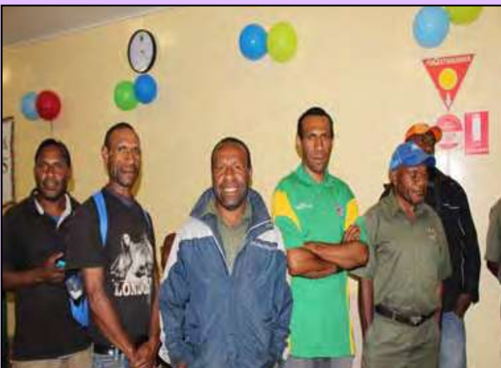
Smiling faces at the farewell function for retired staff in Aiyura.