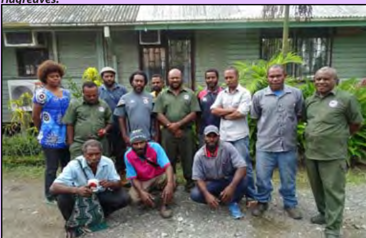
PPAP field officers attending a household survey training at Lae DAL office.