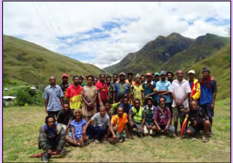
Coffee farmers of Pelato Kofi Group outside Buang LLG station following their meeting with CIC-PPAP officers in October. The background is the Buang River.