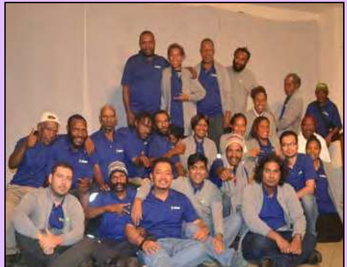
Olam team after the 2016 Business Partners Meet in Goroka.