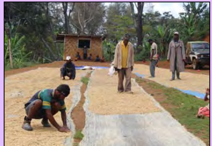
Villagers at Mitega coffee factory in Goroka sun drying coffee.