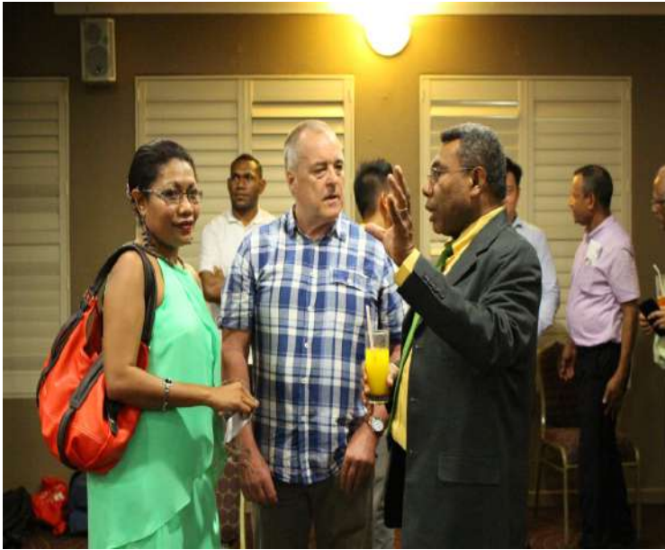
CIC Accountant in discussion with invited guests during the 2015 NCCC