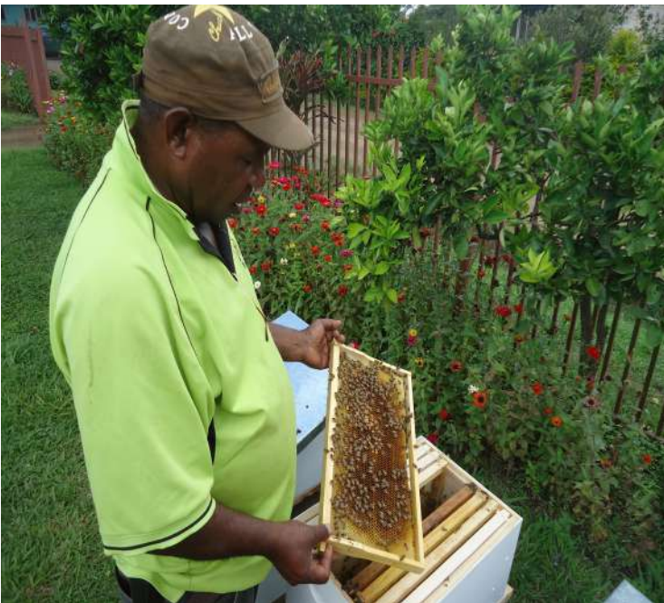
Provincial DAL officer inspecting honey bee hives before transportation to farmers in Usino by CIC