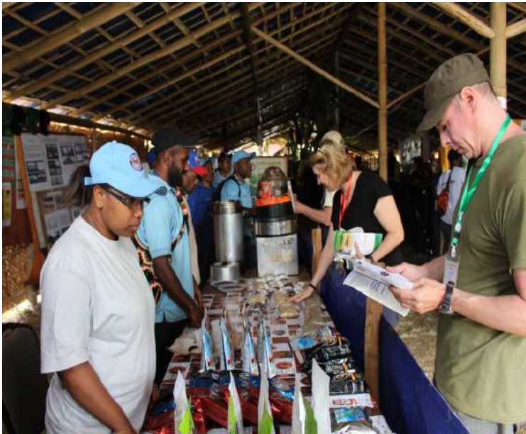
Tourists checking out coffee packets during the 2015 Goroka show