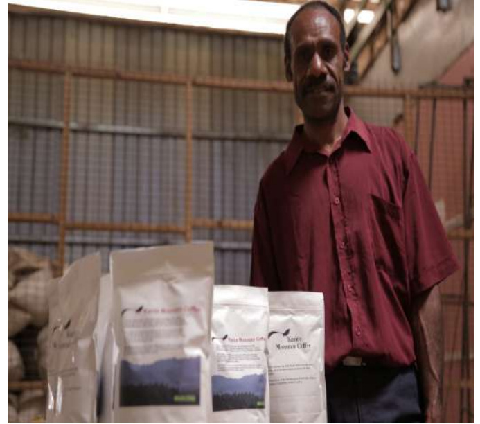
Promoting smallholder coffees packed in 250 grams packets- Kanite Kirapim Association