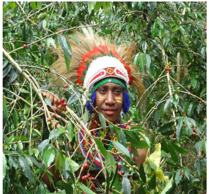
A young girl dressed in traditional attire as she harvests coffee cherries