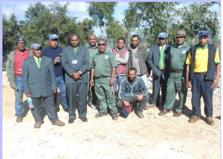
CIC team with villagers during the visit to lalibu