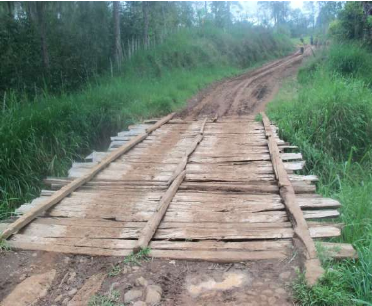
The access road from Tairora High School to Nompia which the Lamari people often use has 13 bridges built in similar fashion. Only 4-Wheel Drive vehicles use this road. Five of these very bad bridges will be rebuilt by the Project that will have a life span of 20 plus years.