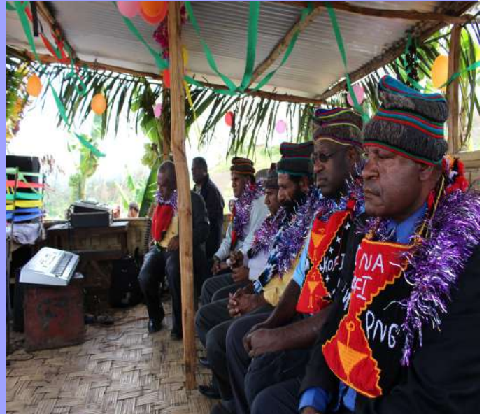
CIC Management team during the vehicle presentation to Avina Coffee Cooperative of Kainantu