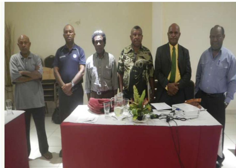
The new executives of PNG Smallholder Coffee Growers Association following their election at the AGM in Goroka.

A total of 17 coffee farmer representatives from the provinces attended the one-day meeting.