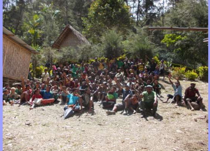
Gesture of welcome by a community in Dusun, Madang Province during a visit by CIC officers