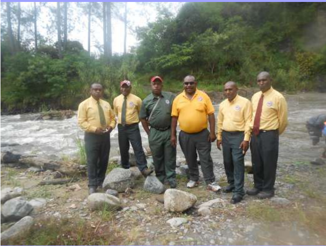
Team CIC during a recent trip to Watut for the coffee partnership program with the district