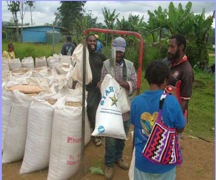
A lady selling her parchment coffee to a roadside buyer in Kainantu, Eastern Highlands Province