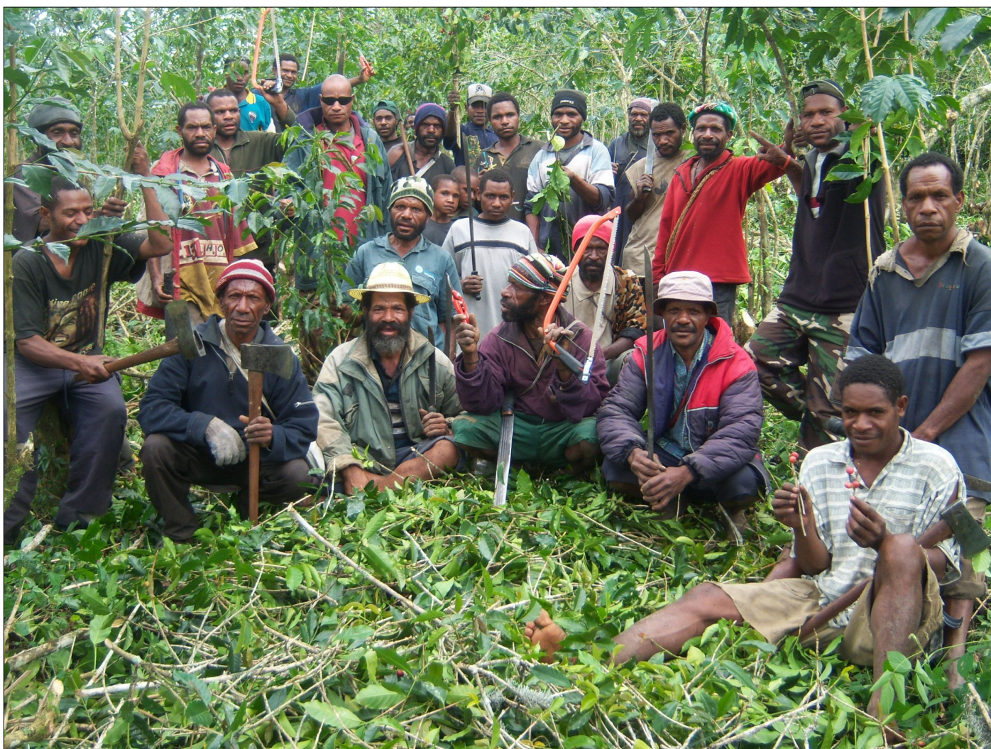
Villagers from the Lai Valley posing for a photo after the rehabilitation work on the Komp plantation. Photo and story by Matei Labun

The plantation is now fully rehabilitated, including plantation roads. Infilling and expansion of young coffee trees is also progressing.