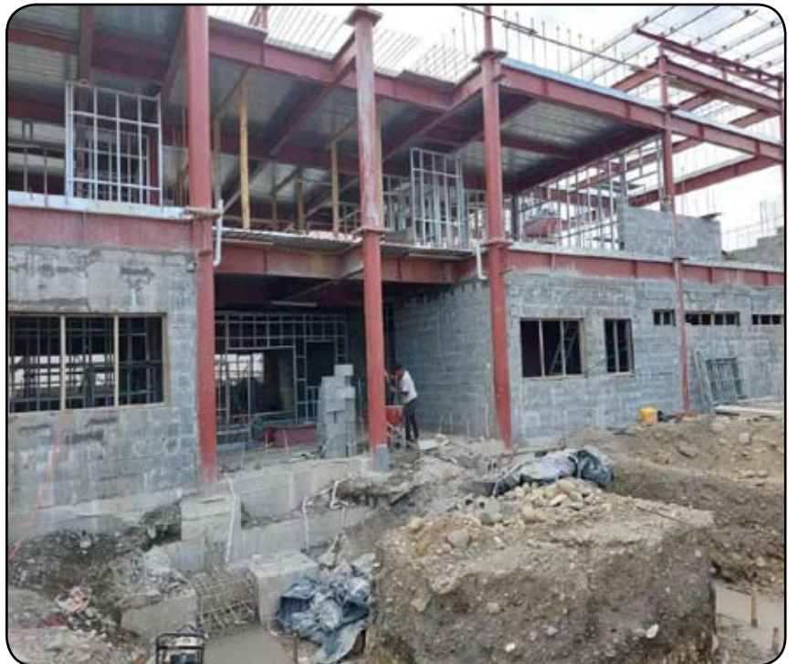
New coffee export building construction work progresses.