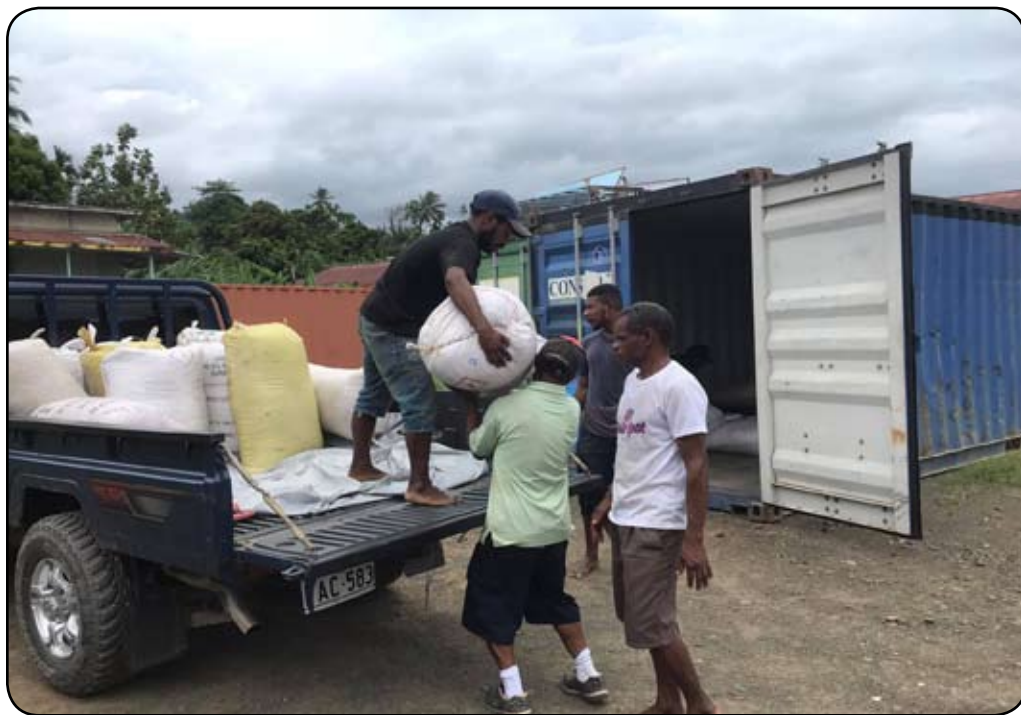
Farmers in Milne Bay Province loading coffee bags to a container for export to Lae. The farmers also benefited under the freight program.

The program hopes to ensure “better factory gate/door price markets accessed” by the remote coffee farmers where there is no road access and or road transport.