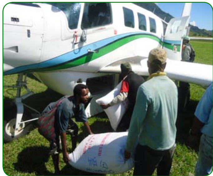
Farmers in remote Negabo in Simbu Province loading coffee bags onto a CIC-chartered aircraft for freighting to Goroka.

"We are very optimistic and want to work with the government aspirations, do our very best to deliver to the people. The board is yours as the government appoints it. Every day we are thinking about what difference we can make for this industry. We want to deliver to the people with your support."