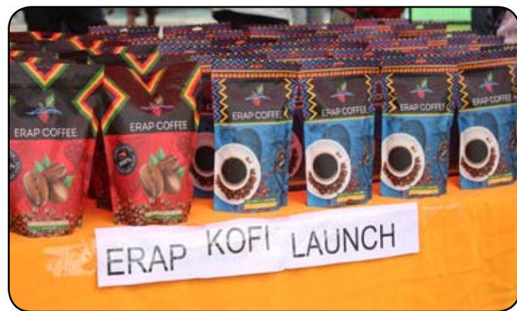
Wia Trade's Flagship brand, Erap Coffee on display during the launching of a number of projects at Nadzab on Thursday, May 16th, 2024.