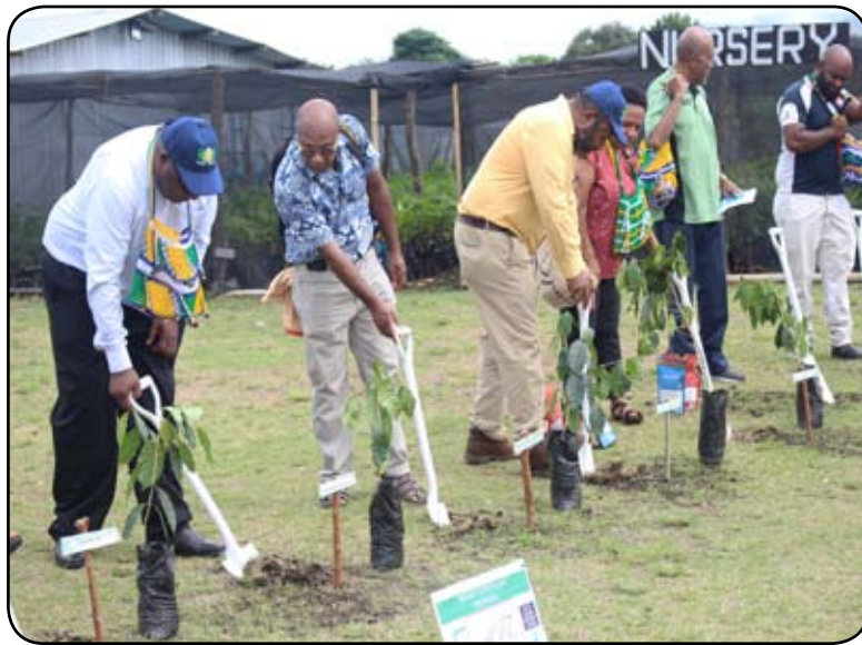
Ground breaking ceremony of the new Wia Trade Enterprises Ltd downstream processing plant at Nadzab in Lae, Morobe Province.