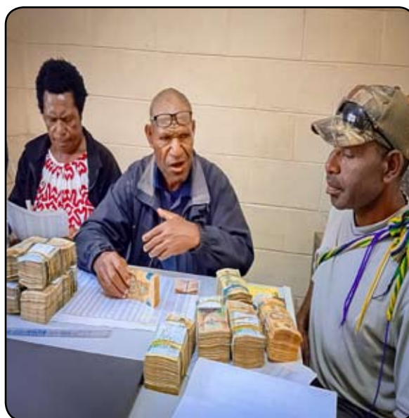
Huwa Coffee Farmers' Cooperative Society (HCFCS) Executives making cash payments to its hard working coffee farmers at Lufa Station in Eastern Highlands Province.