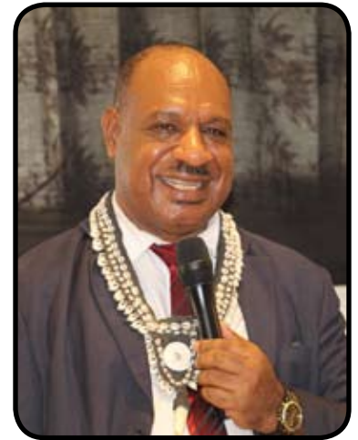
Coffee Minister Hon. William Bando

The following business houses and organizations are acknowledged for their support in sponsoring this conference; Bank of South Pacific, Coffee Industry Corporation Ltd, Theodist Ltd, MVIL, Kongo Coffee Ltd, PNG Ports Corporation, Government Printing House, NAS-FUND and BSP Life PNG Ltd.