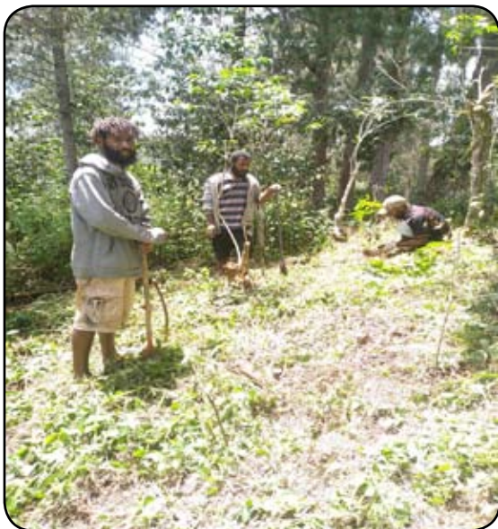
Tertiary students of Unggai-Bena district planting new coffee trees to receive assistance from the local MP.

He highlighted that the coffee and school fee subsidy program cost K5 million. K4.1m was paid to school fees, whilst K900, 000 for nursery materials under the district's partnership with the Coffee Industry Corporation Ltd (CICL).