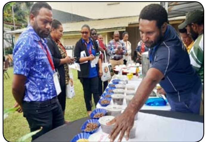
L: Some of the participants at the 2024 CPA-PNG Conference in Goroka. R: Participants take time out for coffee break at the CIC information booth at the Bird of Paradise Hotel last month. Pictured are CIC staff serving coffee and having a chat with the conference participants.