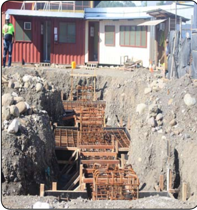
Photos of the Lae Exports Office in the initial construction stage.

Haom Builders was awarded the contract in 2020 by the National Government at the cost of K10.6 million to construct the new Coffee Exports Office.